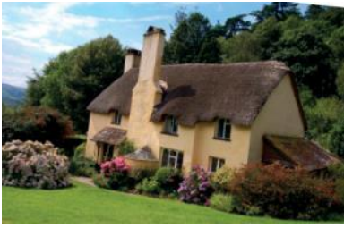
cottage – hiša na podeželju

Matt's parent's live in a cottage in a village in Sussex, in southeast England. They've got a dog and two cats. Matt says 'I love my mum and dad's house. It's so quiet and peaceful. And it's got a beautiful garden. I'm very jealous!'